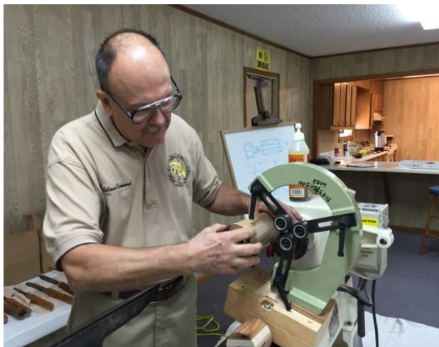
Steady rest makes deep central boring more secure