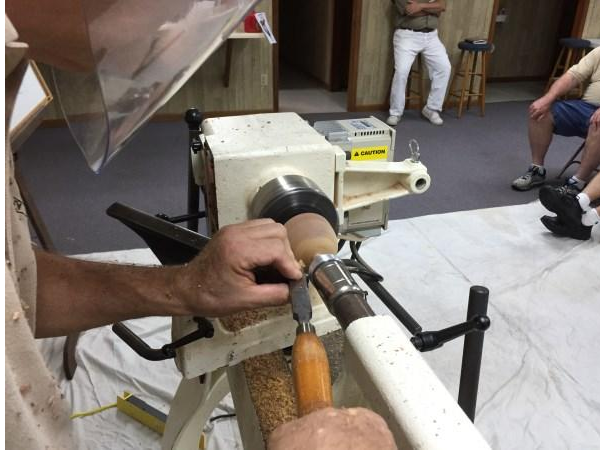
Negative rake scraping of the end grain