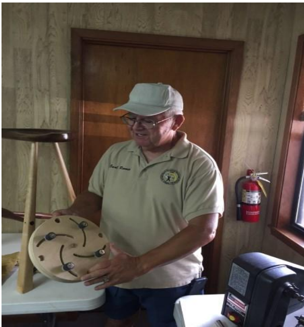
Earl's Longworth chuck, homemade