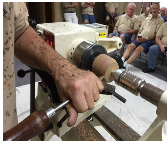
Decapitate the blank and shape the head first