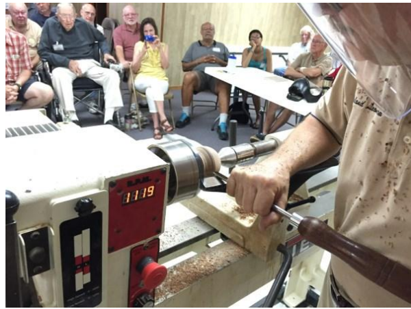
surgically shaping the head piece