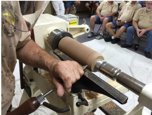
Beginning the shape the body of the peppermill