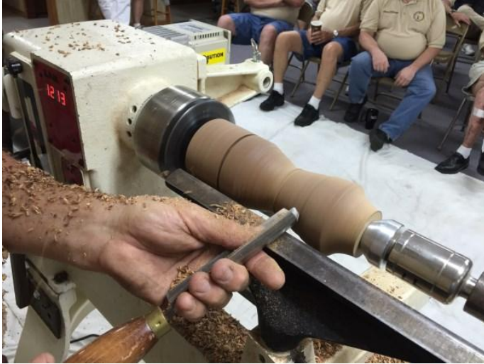
Final form taking shape